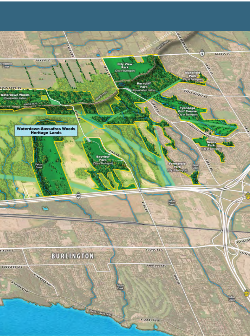
Last updated February 2021.

The goals set out in this strategic plan were identified by the participating partner agencies as crucial for the development of the EcoPark System through 2030. The partner agencies invite participation in achieving these goals by a wide range of interested persons and groups, other orders of government, NGOs, and the private sector, including those already volunteering as the “Friends of the EcoPark System.”